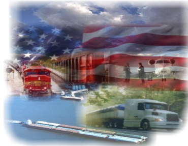
35,000 s/f facility with rail spur available

Our area's industrial base is critical to the health of our local economy. Studies show that 80% of economic growth and job creation comes from existing